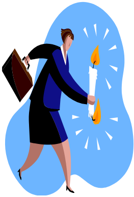
Burning the Candle at Both Ends

March was a very busy month with: the participation of students in and the hosting of the ACSI Spelling bee by ICA; the performance and production of the Black History program; the college tour of Art Institute of Atlanta by the middle and high school students; the completion and display of science projects by the students of ICA; the taking of spring pictures; the hosting of ICA open house by the staff; and the support by your attendance at the skate night, breakfast bonanza and the play sponsored by Pleasant Hill Baptist Church. Yes, your “after tax dollars” are at work.